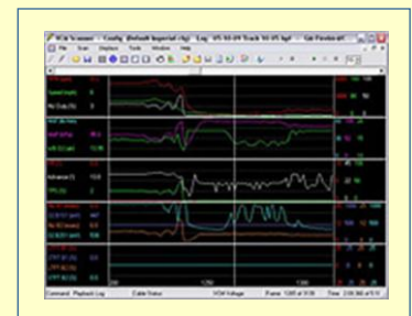
HP Tuners VCM Scanner Screenshot.